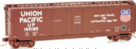
50' Standard Box Car, Double Plug Doors Union Pacific • Rd# 169180 Item #036 00 030...$19.20