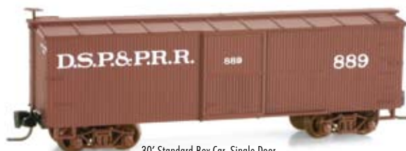
30' Standard Box Car, Single Door Denver South Park & Pacific • Rd# 889 Item #800 00 170...$14.05