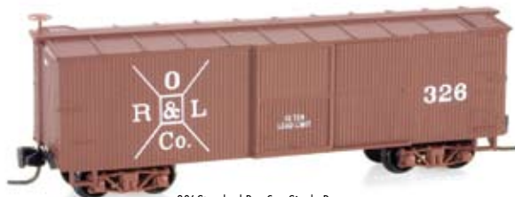
30' Standard Box Car, Single Door Oahu Railway & Land Co. • Rd# 326 Item #800 00 030...$14.65