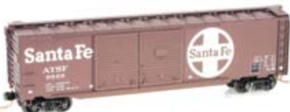
50' Auto Box Car, Double Side Doors and End Doors ATSF • Rd# 9868 Item #078 00 060...$19.15