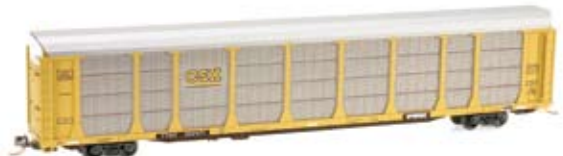
89' Tri-Level Closed Auto Rack CSX • Rd# 902071 Item #111 00 112...$36.90