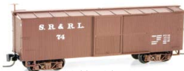
30' Standard Box Car, Single Door Sandy River & Rangeley Lakes • Rd# 74 Item #800 00 150...$14.65