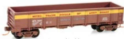
40' Drop End Gondola MTL Anniversary Car • Rd# 2007 Item #083 00 035...$21.10