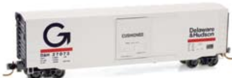
50' Standard Box Car, Single Door, w/o roofwalk Delaware & Hudson • Rd# 27073 Item #077 00 060...$18.80