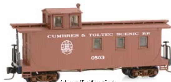
Caboose w/ Two Window Cupola Cumbres & Toltec Scenic • Rd# 0503 Item #816 00 020...$23.60