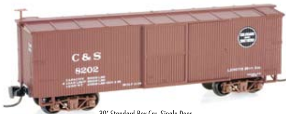
30' Standard Box Car, Single Door Colorado & Southern • Rd# 8202 Item #15106...$15.65