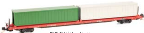
89'4" COFC Flat Car w/ Containers Canadian Pacific • Rd# 521135 Item #072 00 230...$36.60