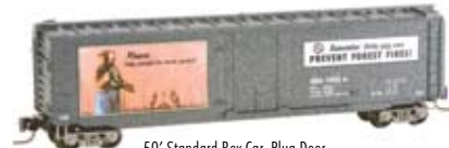
50' Standard Box Car, Plug Door Smokey Fire Prevention #1 • Rd# 1953A Item #507 00 310 (MM)...$23.70 Item #507 00 311 (Mkln)...$21.90