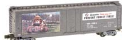
50' Standard Box Car, Plug Door Smokey Fire Prevention #4 • Rd# 1980A Item #507 00 341 (Mkln)...$21.90 *Magne-Matic shown