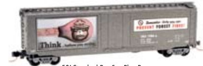
50' Standard Box Car, Plug Door Smokey Fire Prevention #5 • Rd# 1983A Item #507 00 350 (MM)...$23.70 Item #507 00 351 (Mkln)...$21.90