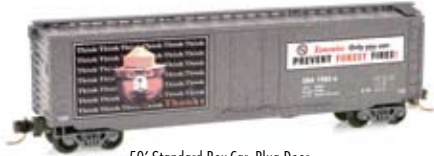
50' Standard Box Car, Plug Door Smokey Fire Prevention #6 • Rd# 1982A Item #032 00 406...$18.35