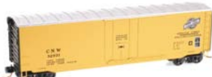
50' Standard Box Car, Plug Door w/o roofwalk Chicago & Northwestern • Rd# 32931 Item #038 00 180...$20.60