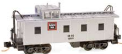
36' Riveted Steel Side Caboose, Offset Cupola CB&Q • Rd# 13501 Item #100 00 290...$23.55