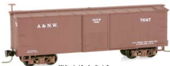
30' Standard Box Car, Single Door Austin & North Western • Rd# 7047 Item #800 00 140...$14.05